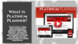
Easy Demo Scheduling!

View the 90 Second Intro to Platinum Planner Video!