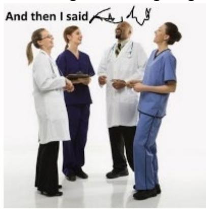
Leaving You Laughing