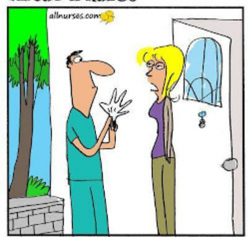
"I know it's a nursing habit, but do you have to put on gloves every time you touch me?"