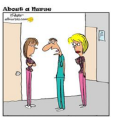
"He's in shock. It's not the first time this has happened when I give a murse the holidays off."

LOOKING FOR STATE RN, LPN and LVN CONFERENCES! Do you know of a RN, LPN or LVN conference that we simply CANNOT miss? Please <u>drop us a line</u> and let us know! We'll even send you a thank you gift!