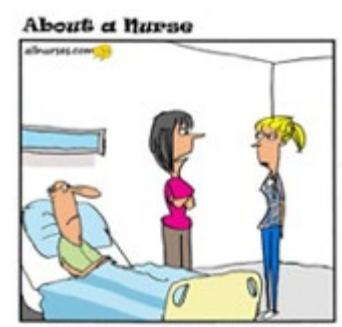
"I'm a close relative, and I did some research on the Internet about his condition, so I feel I'm more qualified to take care of him than some nurse."

We are looking for State and National RN, LPN/LVN conferences! Do you know of a RN, LPN or LVN conference that we simply CANNOT miss? Please <u>drop us a line</u> and let us know! We'll even send you a thank you gift!