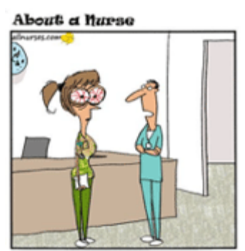
"I was going to ask you how your chang from day shift to night was going, but I think I can guess the answer."

We are looking for State and National RN, LPN/LVN conferences! Do you know of a RN, LPN or LVN conference that we simply CANNOT miss? Please drop us a line and let us know! We'll even send you a thank you gift!